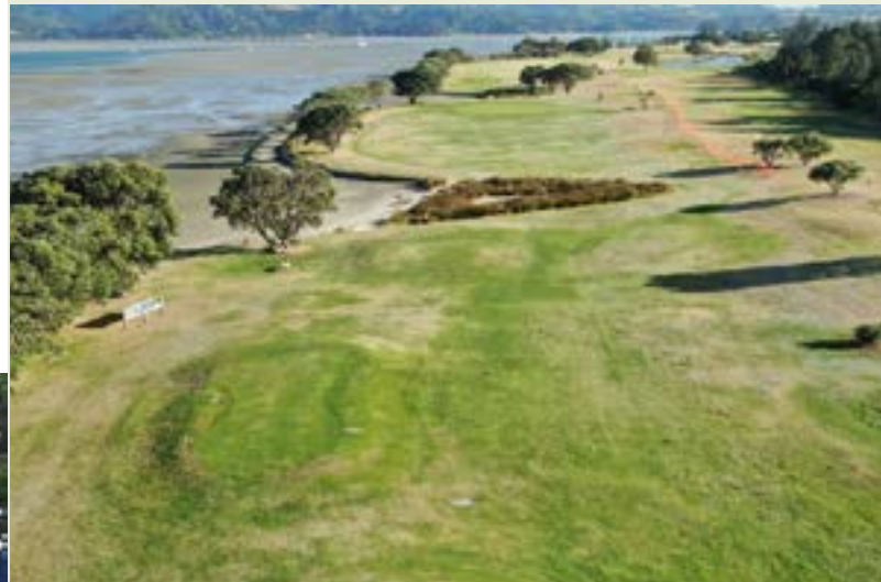
The 15th before the redevelopment.