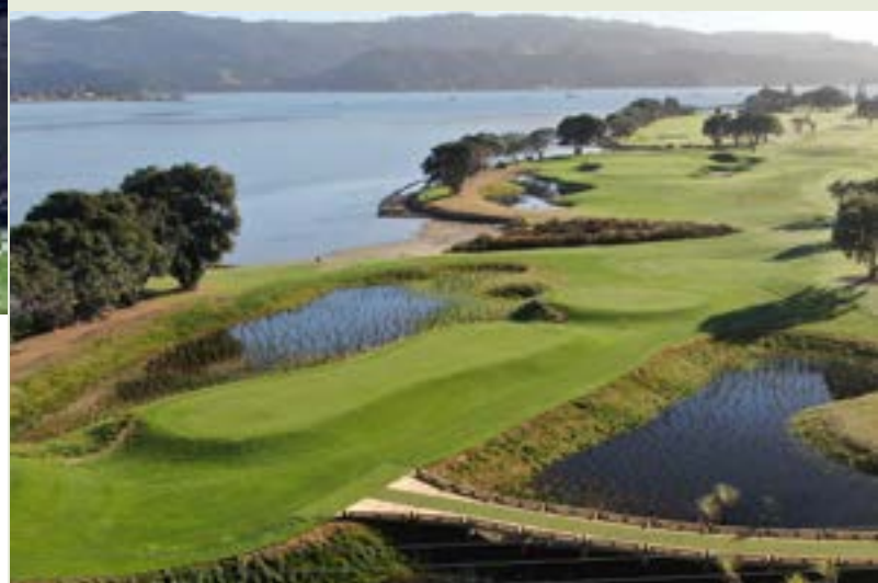
The 15th after the redevelopment.